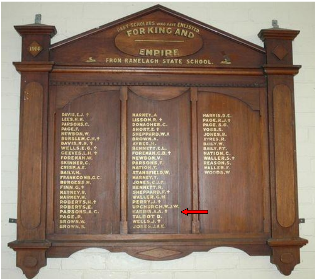
Ranelagh State School Honour Board