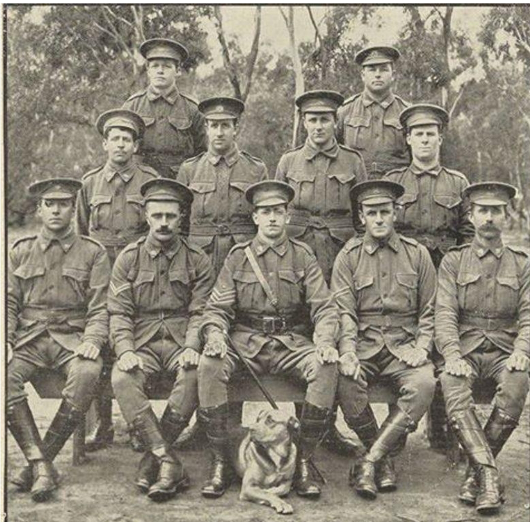
(Weekly Courier, Tasmania - 16 August 1917)

Information obtained from the Australian War Memorial (Roll of Honour, First World War Embarkation Roll) & National Archives