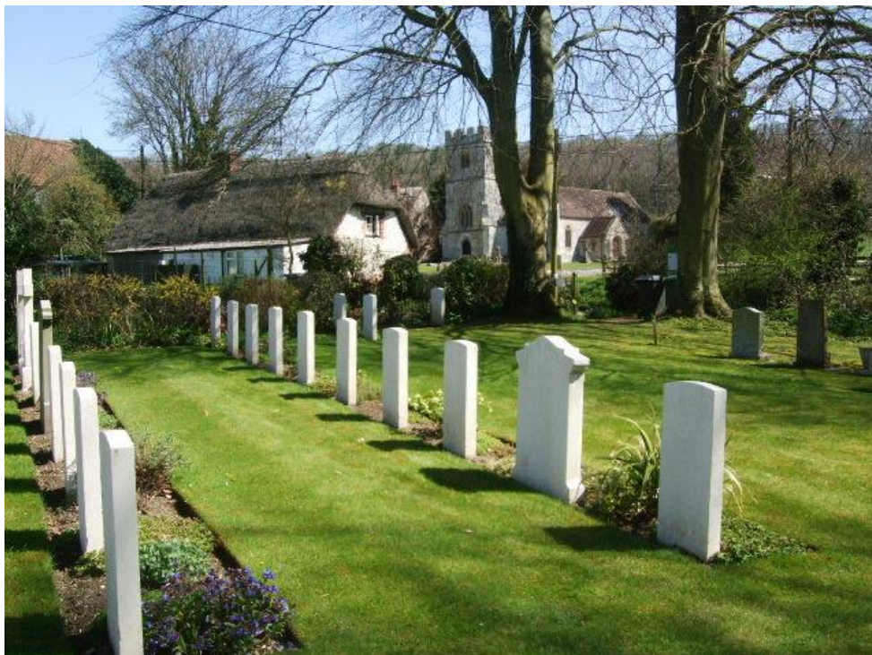
St. Mary's New Churchyard, Codford