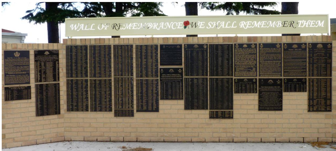
Wall of Remembrance, St. Helens, Tasmania

"What these men did nothing can alter now. The good and the bad, the greatness and the smallness of their story will stand. Whatever of glory it contains nothing now can lessen. It rises, as it will always rise, above the mists of ages, a monument to great hearted men; and for their nation, a possession forever."